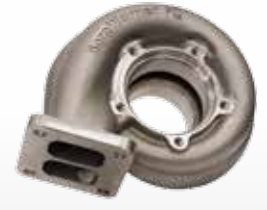
Compressor Cover SX-E Style